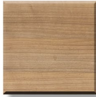
(SC) Santiago Cherry