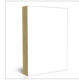
(PLY) Plywood Edging Tape