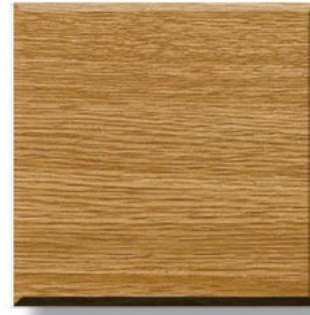
(LO) Light Oak