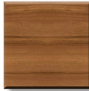
(DN) Dijon Walnut