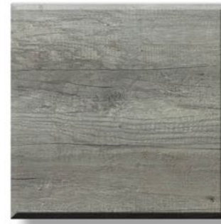
(NO)* Nebraska Oak