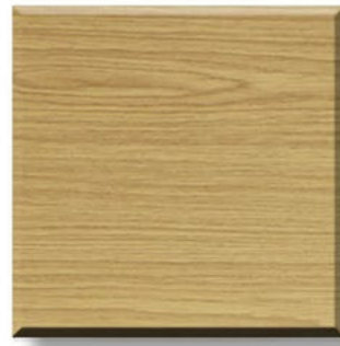
(SO) Stone Oak