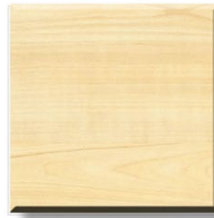
(CM) Canadian Maple