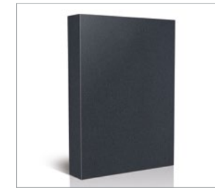
(Qudos Grey) Qudos Graphite Grey RAL 7024