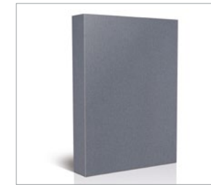
(G) Grey RAL 7012