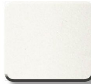
(W) White RAL 9016

All metalwork is epoxy powder coated with a choice of up to 5 finishes as standard.