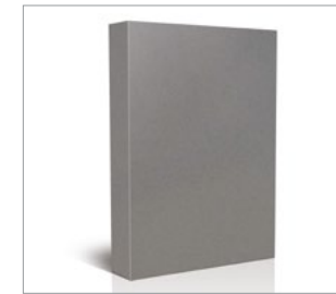
(S) Silver RAL 9006