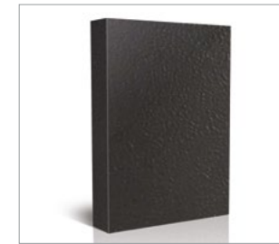
(BL) Black RAL 9017