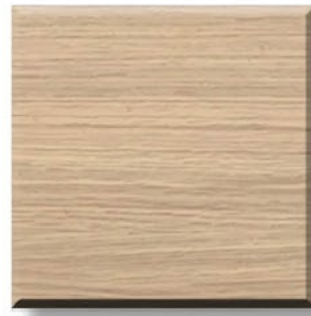
(VO) Verade Oak