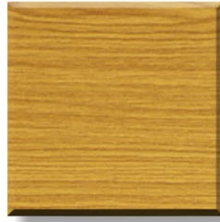
(CO) Calva Oak